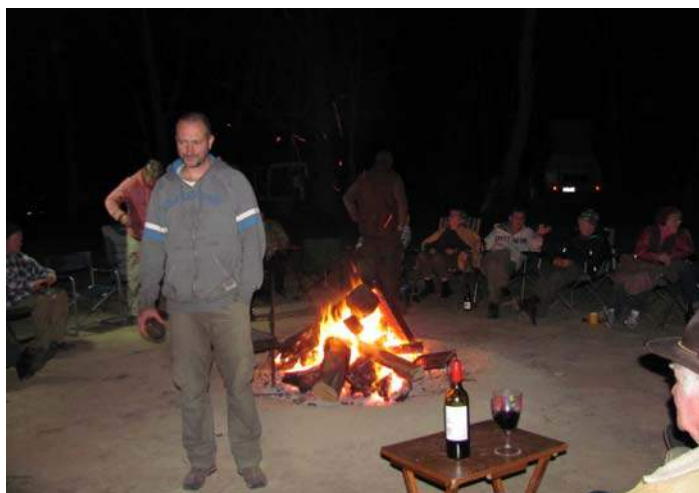
Round the campfire Saturday Night.