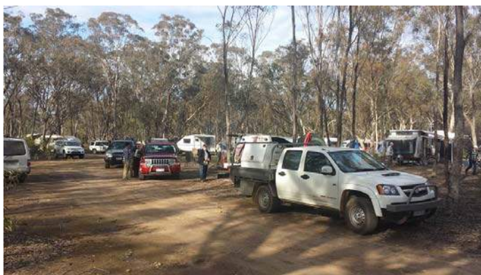
The scene around the camp.