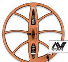
Coin & Relic 15" X-TERRA 18.75kHz © Fully submersible