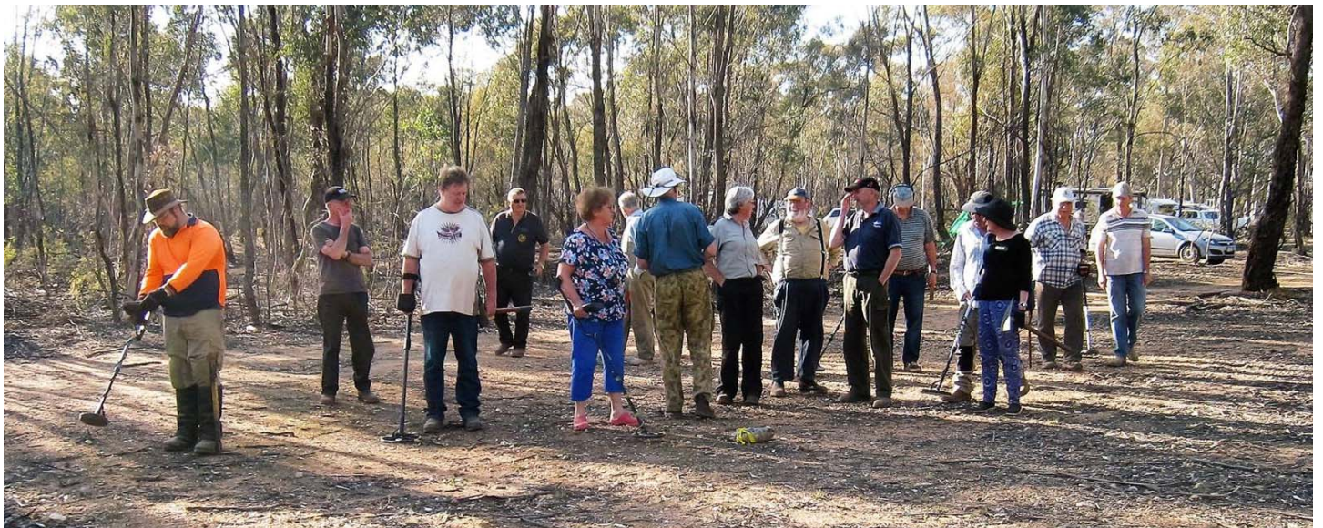
Treasure Hunt activity on Sunday Morning.