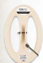
Goldstalker 14x9" BLITZ

You can rely and trust in their range of metal detector coils and accessories, knowing that you are Optimising Discovery when prospecting and metal detecting. Look for their fully Minelab approved X-TERRA coils.