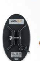
Treasureseeker 10x5" Etrac DD © Fully submersible

COILTEK® Manufacturing 5 Mengel Court, Salisbury South, SA T 08 8283 0222