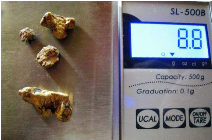
Anja's 3 nuggets on top and Alistair's 4 gramer.