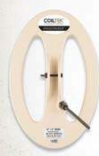
Goldstalker 14x9" BLITZ

You can rely and trust in their range of metal detector coils and accessories, knowing that you are Optimising Discovery when prospecting and metal detecting. Look for their fully Minelab approved X-TERRA coils.