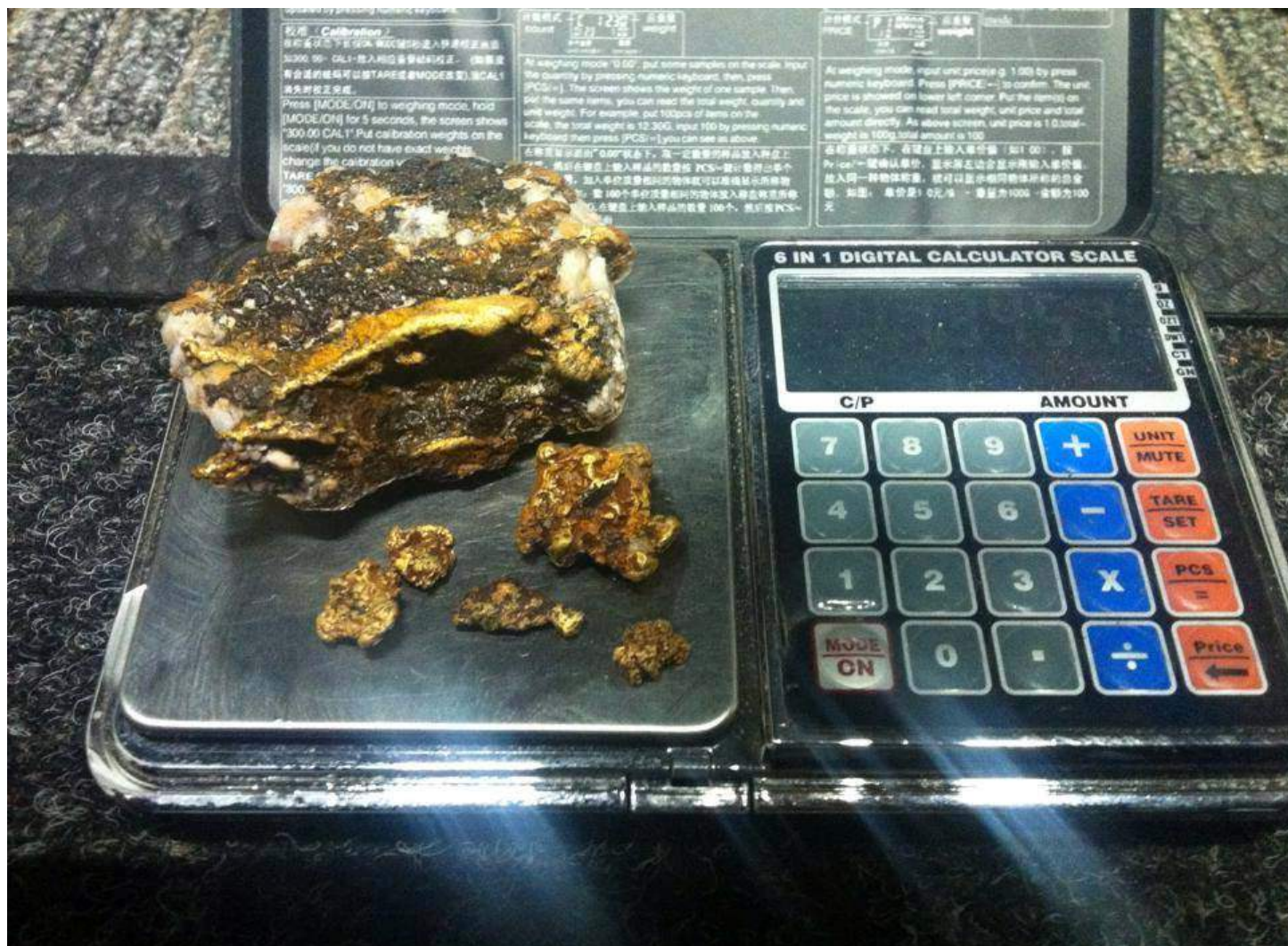
Member's Finds: The large specimen/nugget is 121 grams with a estimated gold weight of 80g. The next biggest lump is 8.5 grams.