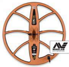
Coin & Relic 15" X-TERRA 18.75kHz © Fully submersible