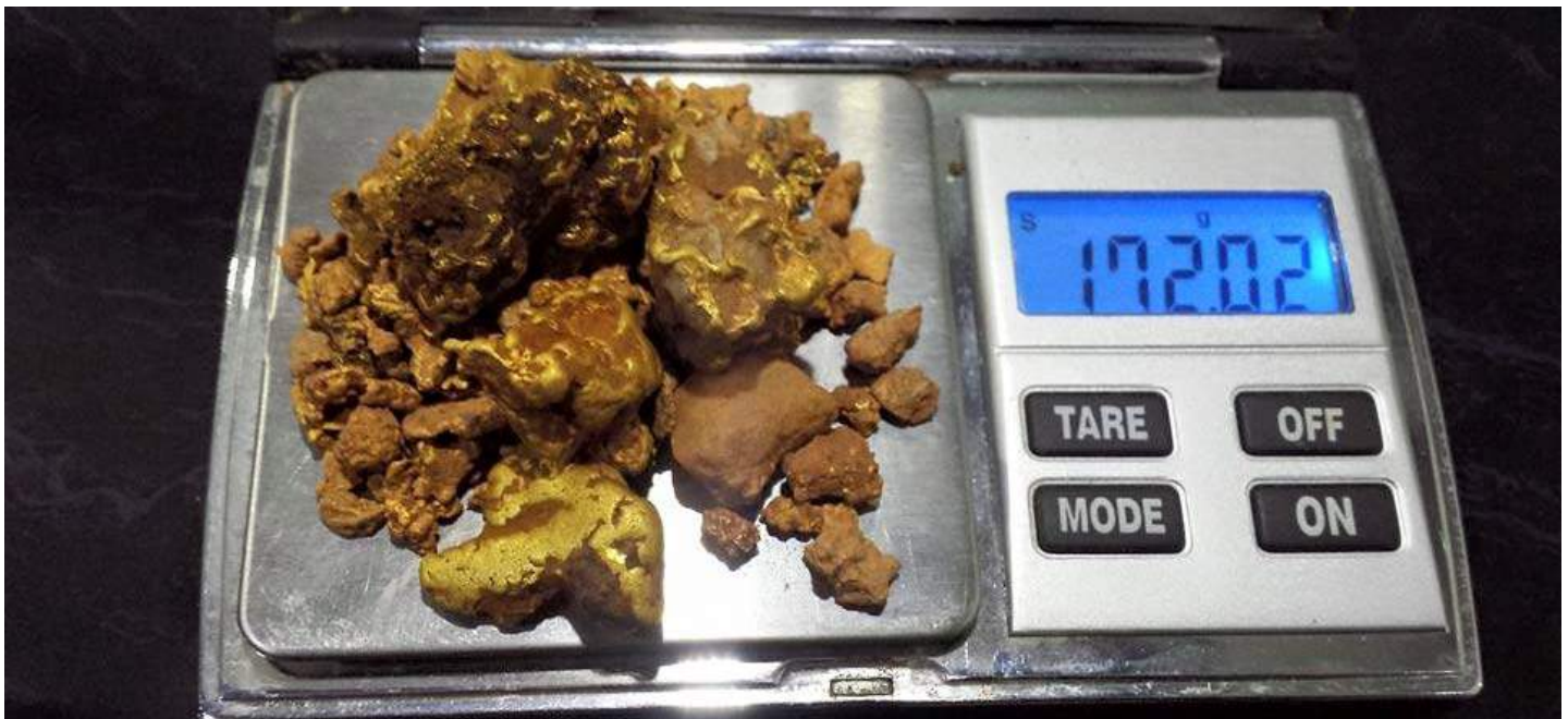
Member's Finds: Rob's final tally of nuggets from the recent WA trip of 172 grams plus another 10 grams from a large specimen.