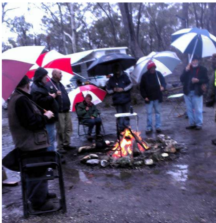
The umbrellas were out in force.