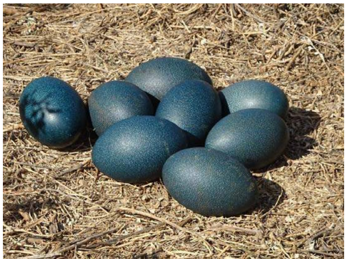
Nest of Emu eggs.