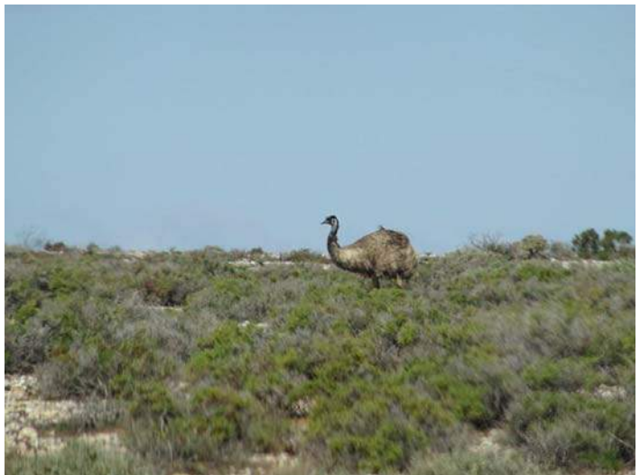
"Old Man Emu" watching over the eggs.