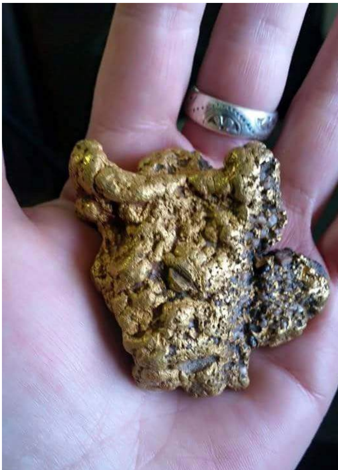
230g at 8 inches with a Minelab SDC 2300 (Not a member).

Posted by rcr2burke on 23 July 2015 on Gold Prospectors forum. I thought I would share with you a few photo's of a bit I picked up late last year at "Western Creek" NQ, this bit was coated in Ironstone & only had a small sliver of "Gold" showing on one side, so recently I put it into some "Hydrochloric Acid" to get rid of the Ironstone & I was amazed at what it turned into, there is no wear to this nugget at all it is 100% crystal structure "Absolutely" the best I have seen.