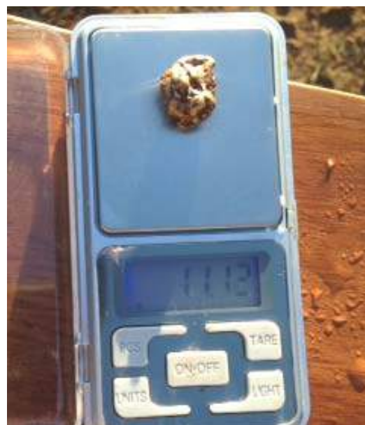
Geoff K's 11.1 gram nugget. Found at the Amherst camp, by Kirky with a Minelab GPZ 7000 going deeper.

Amherst campsite is easy to access although relatively small. There was an abundance of wood on the ground not too far from the main camping area and it is central to Talbot, Maryborough and other gold-field towns. This campsite might be a good option for the hot months as it is close to the main road with easy access in and out.