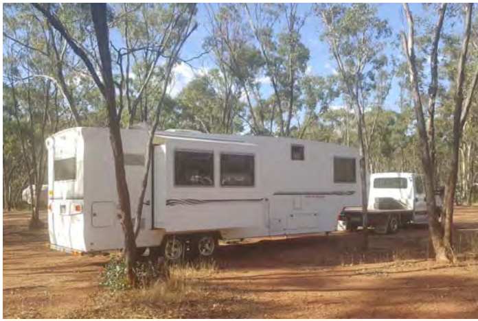
Members fifth wheeler - Wow !!! And inside is amazing to say the least.