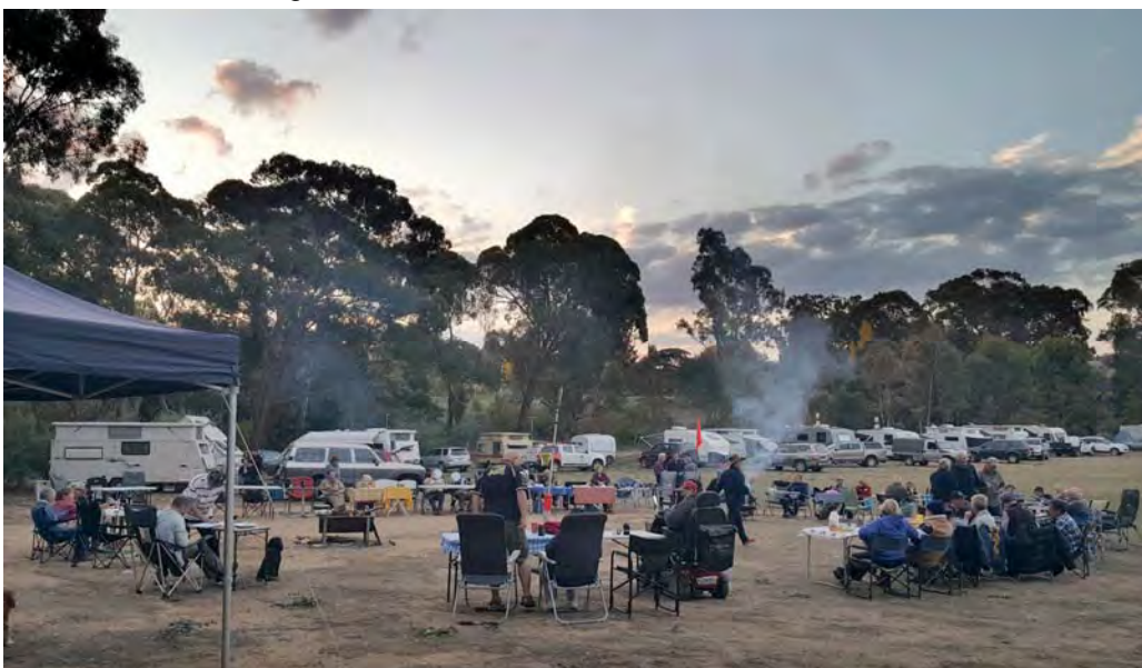
Sunday evening at the campsite.