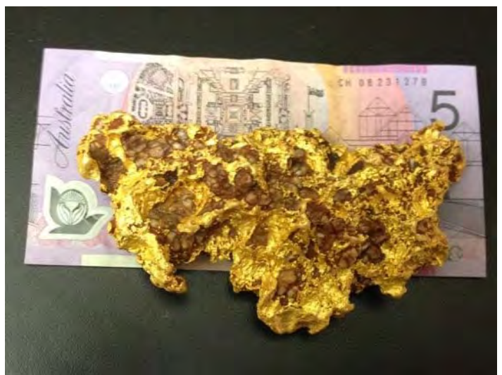
The nugget all cleaned up.