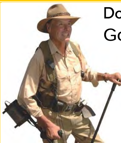
Australia's leading books on gold prospecting and goldfields maps.

Doug's latest book has just been released - "Coin & Relic Detecting in Australia" which is the companion to Doug's popular "Metal Detecting for Gold in Australia".