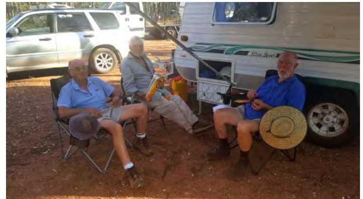
Relaxing in the shade of the caravan awning.