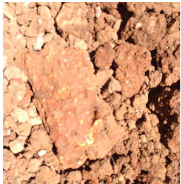
The nugget as it appeared in the bottom of the hole.

Found recently by a VSC member in Victoria's Golden Triangle is this magnificent 16.27 oz. (506 gram) nugget. It was found with a GPZ 7000 with a 14" coil and at a depth of 21 inches. It was a definite signal. The finder dug through the surface soil, then the quartz wash layer and then it was time to get out the crowbar and a fair way into the red clay sat this little beauty. The area was of course gridded around the find and, as is often the case, only a few tiny bits were found.