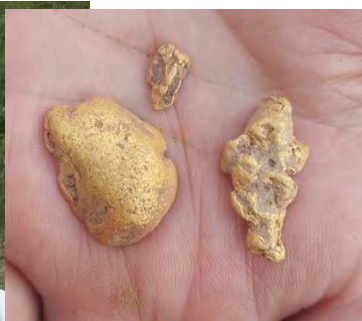
Anja McK. Looking very pleased with her finds. The inset photo shows nuggets of 18,7 & 2 grams.