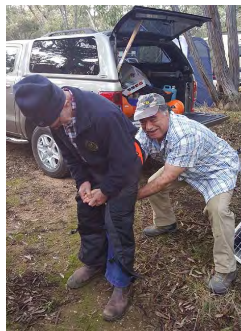
Ohhh dear ... so this is what we get up to at camps!