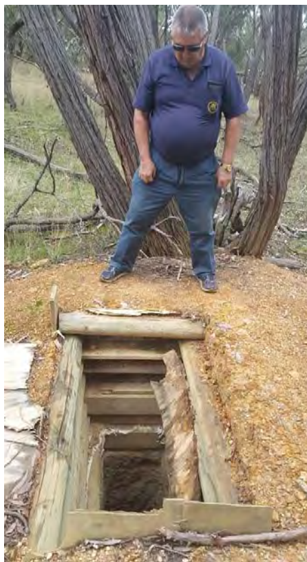
An Alluvial shaft about 3 meters deep near the camp that has been worked recently.