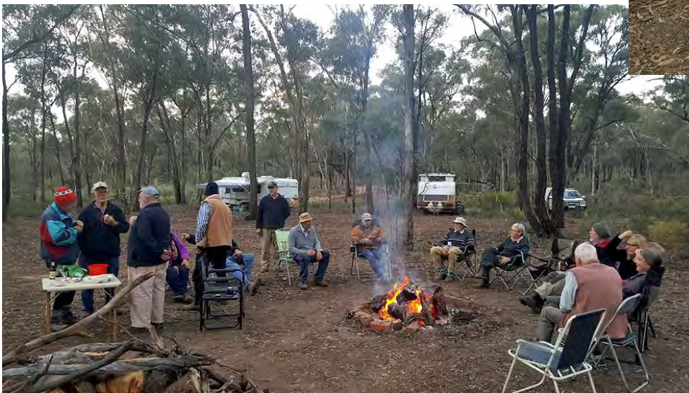
Relaxing and socializing around the main camp fire. In the early evening.