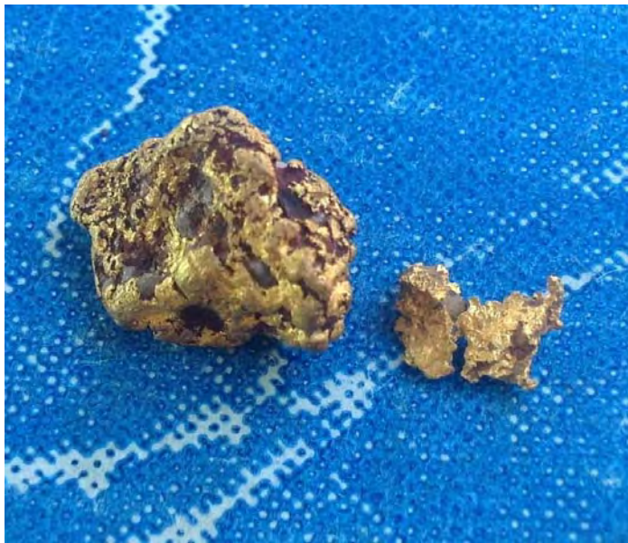
Maryborough June 2017 5g & 0.5g

Nuggets found at Inglewood in June 2016. The largest is 13.5g