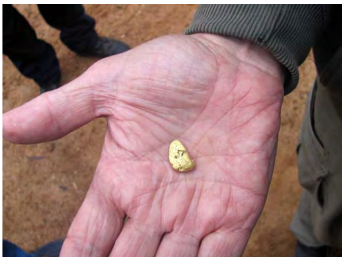
Bob's 9 gram nugget.