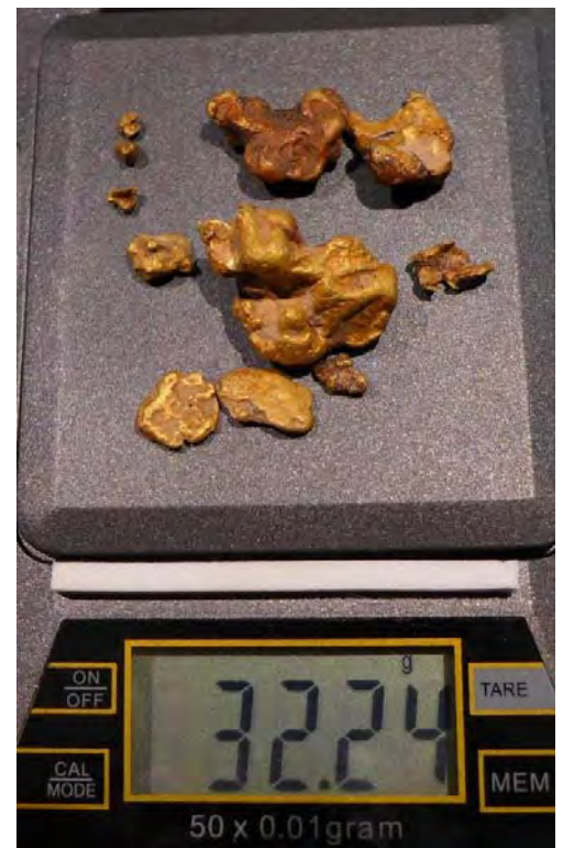
Nuggets Inglewood June 2017 The largest is 2.1g

Nuggets found at Inglewood in June 2016. The largest is 13.5g