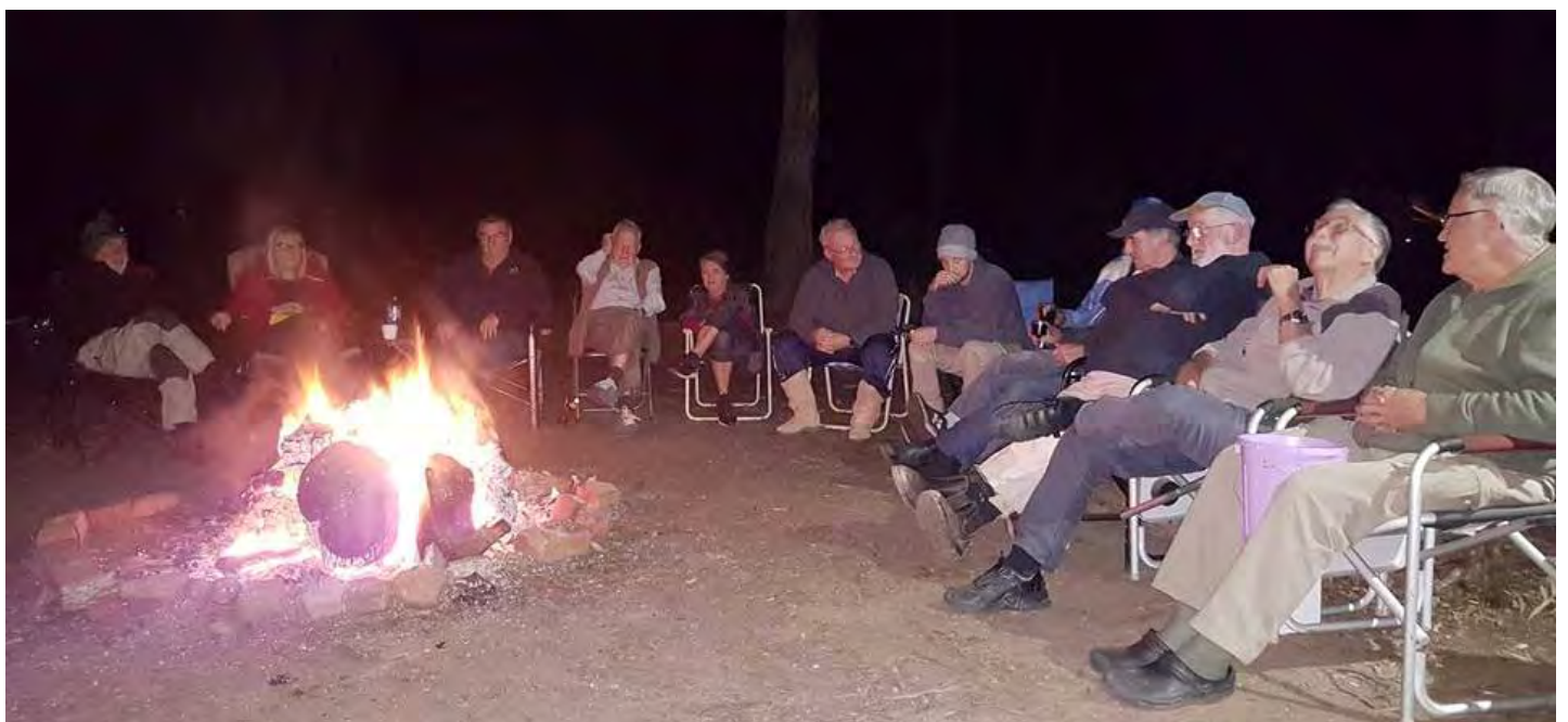
The camp fire with members enjoying the warmth.