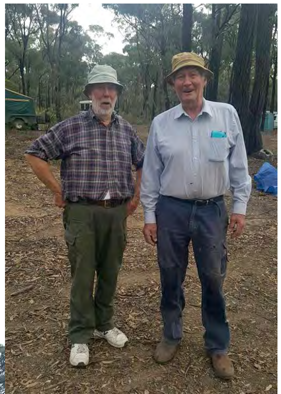
The best dressed prospectors in the bush, time to get dirty lads!