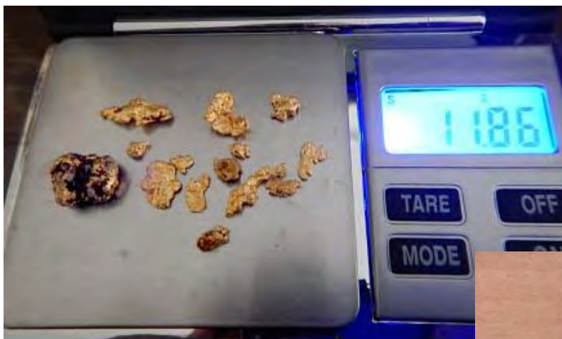
Maryborough June 2017 GPX5000 14x9 Evo coil, the largest is 4g.