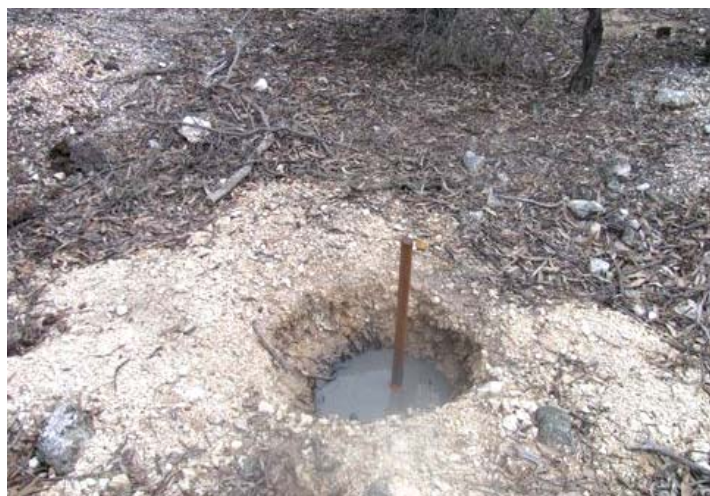
What not to do.

A large detector hole left unfilled in the Whipstick Park by a lazy, irresponsible gold detector operator. It is holes left like this by some senseless bush vandal that give us a bad name. The hole was filled in by a Seekers member.