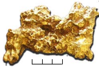
0 10 20 30cm Welcome Stranger Nugget