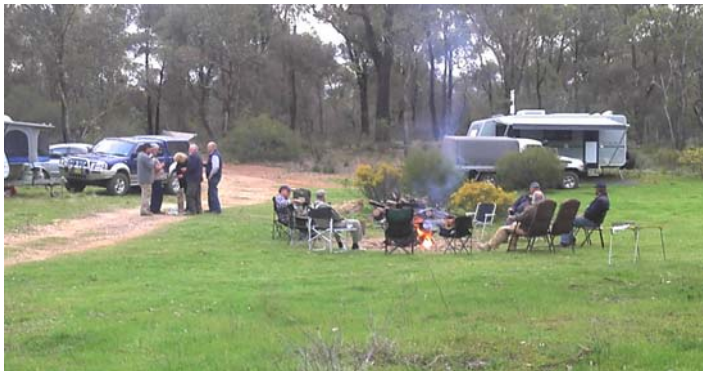
Main Camp fire of the camp.

Finds for this camp were 80- pieces of gold and 12- specimens once again proving the detecting skills of the dedicated club members. All in all, a great camp and a good time was had by all. See you at the next camp.....be there.