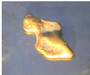
5.6gm Poo Nugget