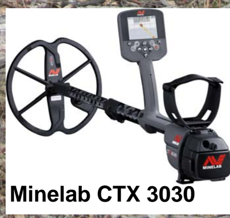
Minelab CTX 3030