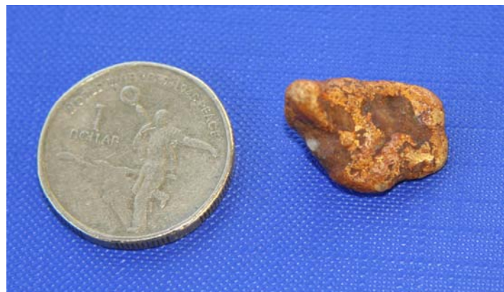
David B.'s 14 gram nugget.