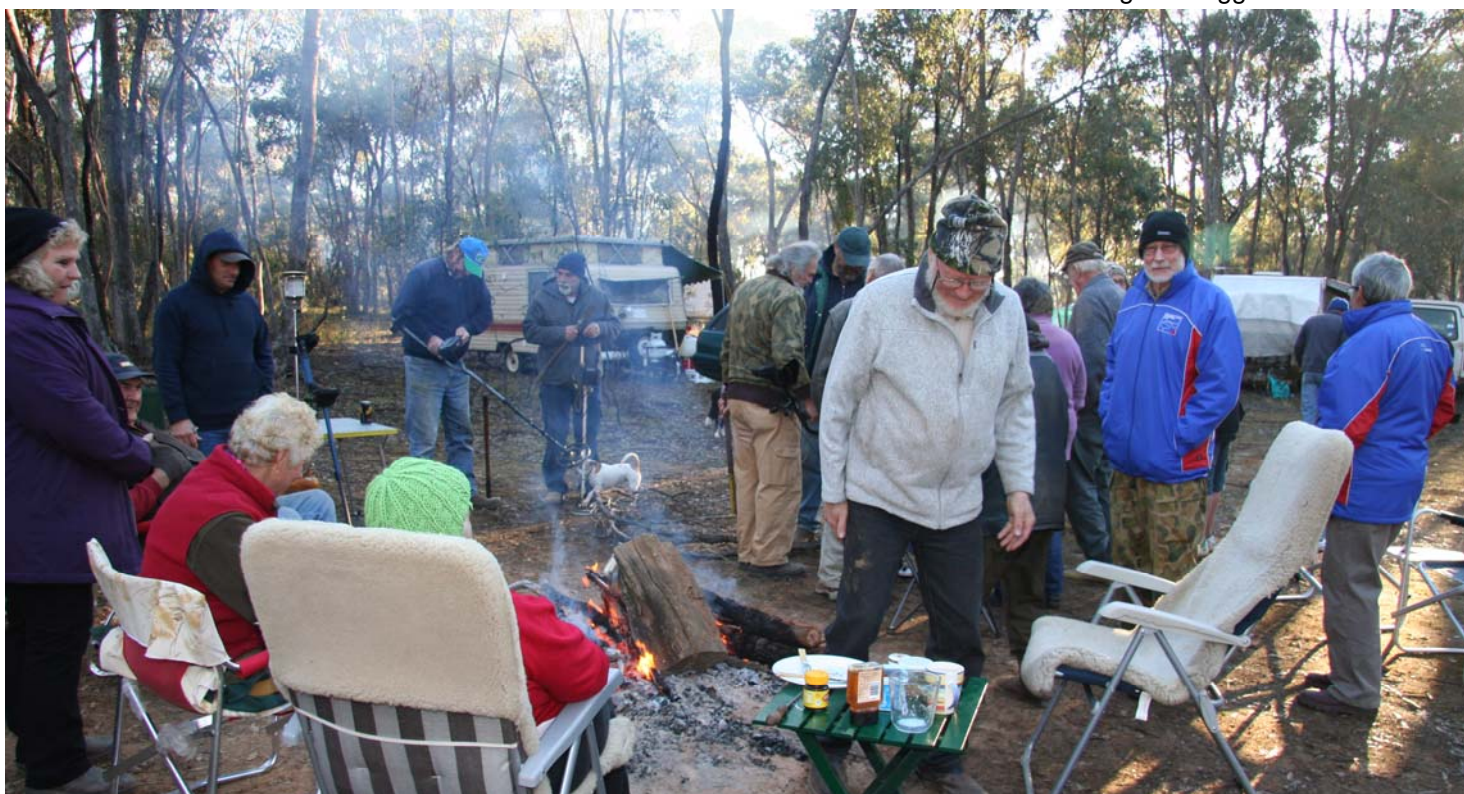
Round the campfire.