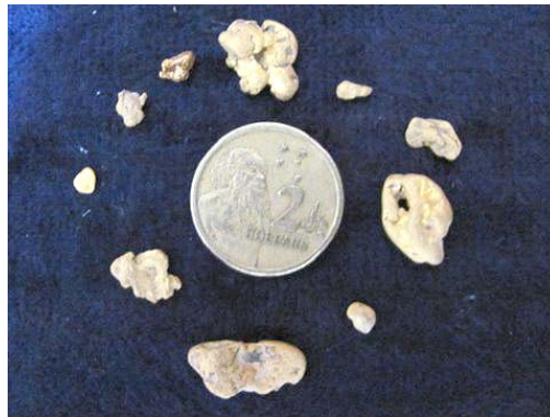
Eric's nice find of 11 grams of nuggets.

For the rest of the holiday we did what we all like doing best and that is chasing the gold and this turned out to be a good camp for that with well with over 100 pieces for around 1.5 ounces, seeing the light of day.