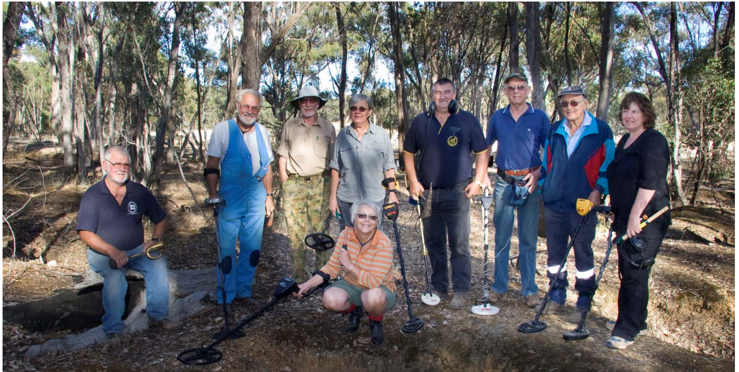
Some of the Treasure Hunt participants.