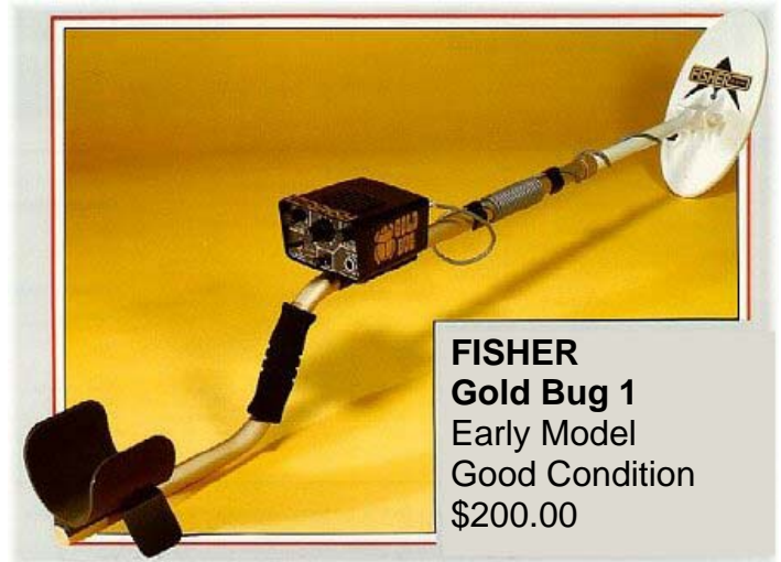
FISHER Gold Bug 1 Early Model Good Condition $200.00