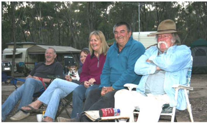
Relaxing on Saturday night..