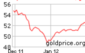
60 Day Gold Price in AUD/g

Over the last 60 days (since the last issue) the price of gold in AU$/gram has dropped from a high of AU$55.00 to a low of AU$49.00 and has now recovered to AU$52.57/gram as at 01/02/2012.