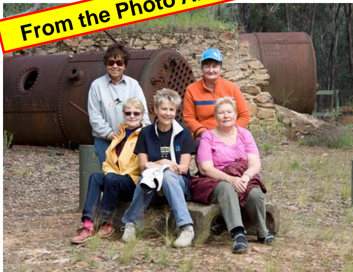
The girls stop for a break during their walk at the old quartz battery on the Craigie West camp November 2011. L-R; (Names removed).