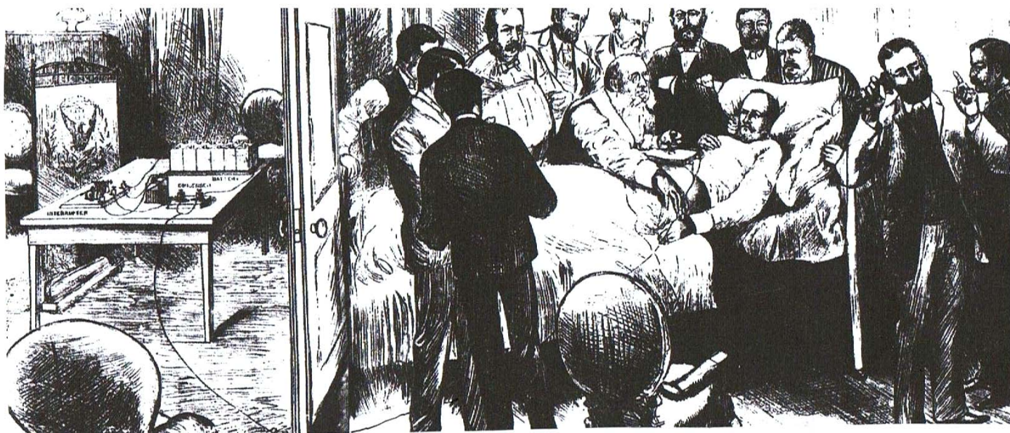
An newspaper illustration from the time showing Bell operating the first metal detector.

Alexander Bell, the founder of the telephone, is also credited with the invention of the first metal detector in 1881. The device was hastily put together in an attempt to find the bullet in the body of US President James Garfield, shot in an attempted assassination. The metal detector worked flawlessly in tests but did not find the assassin's bullet partly because the metal bed frame on which the President was lying disturbed the instrument, resulting in static. The president's surgeons, who were sceptical of the device, ignored Bell's request to move the president to a bed not fitted with metal bed springs. Alternately, although Bell had detected a slight sound on his first test, the bullet may have been lodged too deeply to be detected by the crude apparatus. Garfield died a few weeks later from an infection caused by the probing for the bullet with non-sterile instruments. Bell's metal detector was an electromagnetic device he called the induction balance. Bell was familiar with electrical principles having invented the telephone in 1875.