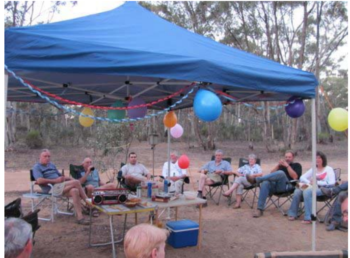
New Year's Eve round the new gazebo.

A great week was enjoyed by about 40 members regardless of the weather.