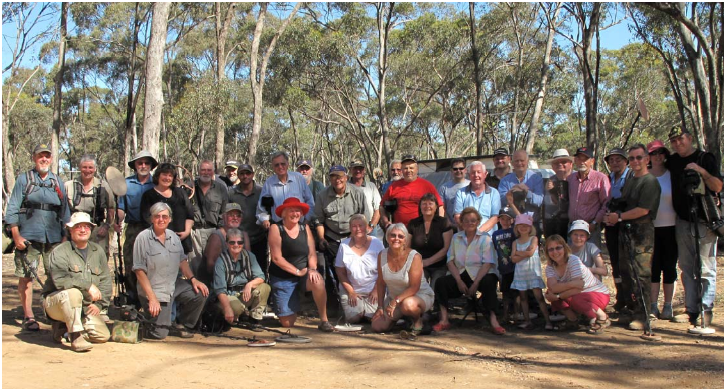
Mt Moliagul group photo December 2011