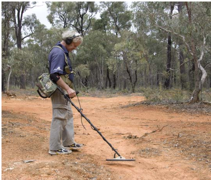
Marty detecting near Snake Gully on the Craigie West camp, November 2011.