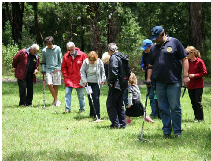
Hopeful members hunting for tokens and keys