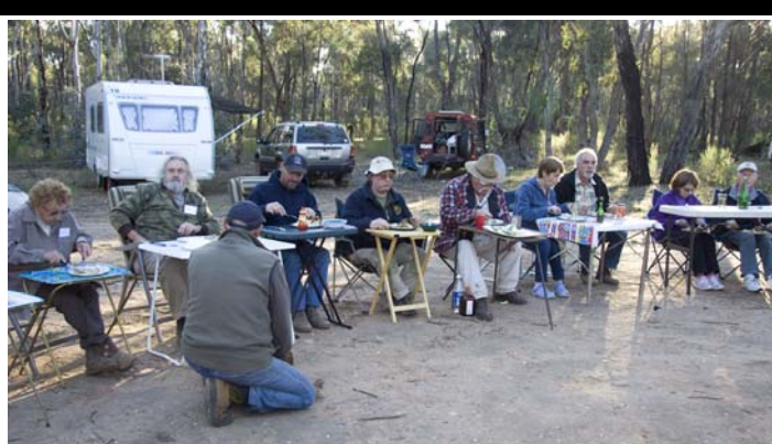
Enjoying the chicken dinner supplied by the club