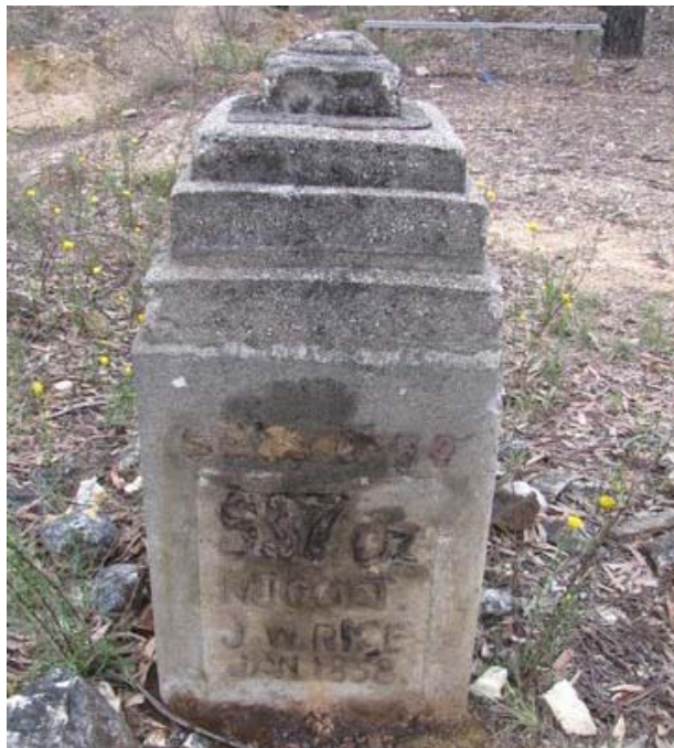
Cairn at Snake Gully to mark the finding of a 537 oz. nugget just 3 kms north of the Craigie West Camp