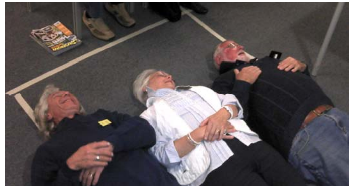
Members were "flat out" enjoying the talk.

This was a very informative evening about what occurred behind those four walls, and the conditions that they endured while incarceration—compared to today's felons who get three meals a day plus a bed and air conditioning etc.