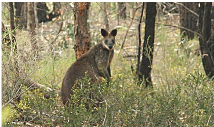
A curious local resident