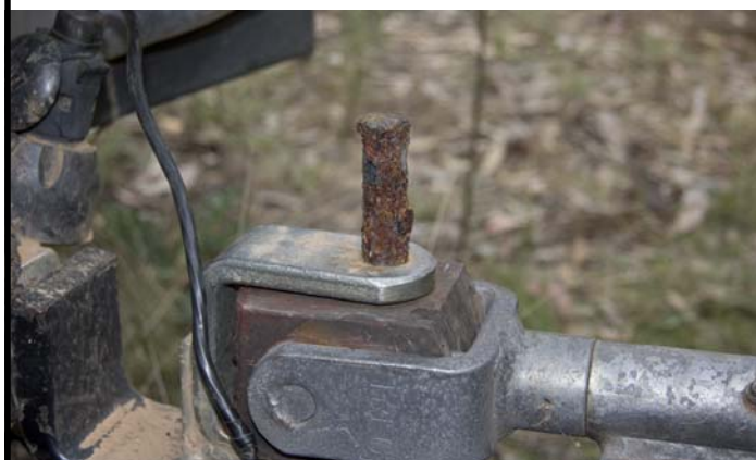
The chisel driven down into the TREG hitch

Not having anything suitable, the pair were facing a quick return trip to Melbourne when it was suggested that an old rusty rock chisel of a very similar diameter that Les had found earlier may well do the job. With a lot of hammering the chisel was forced halfway into the hole and made it back to Melbourne, with a few stops to bash it back in when it worked loose.