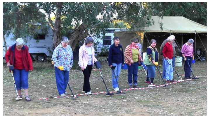
Women's egg & detector race