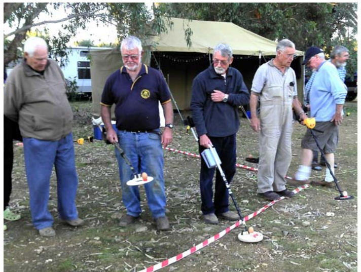
Men's egg & detector race

The Easter Camp with its healthy lifestyle activities, community participation and, renewal and making of friendships; celebrates the joys of life that complement the spirit of Easter. Many Thanks to all who attended and contributed in their own way to a great Easter Camp.