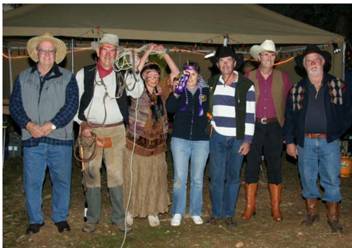
Entrants in the 'Cowboys & Indians' Fancy Dress