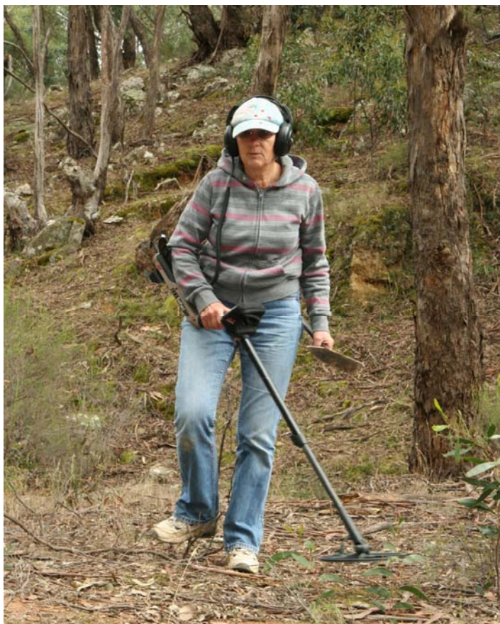
Detecting near Spring Gully