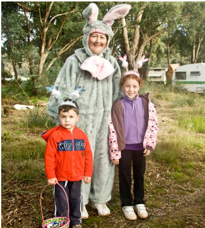
The Easter Bunny with helpers