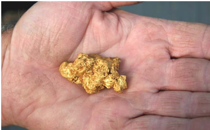
58 gram nugget found on the outing.