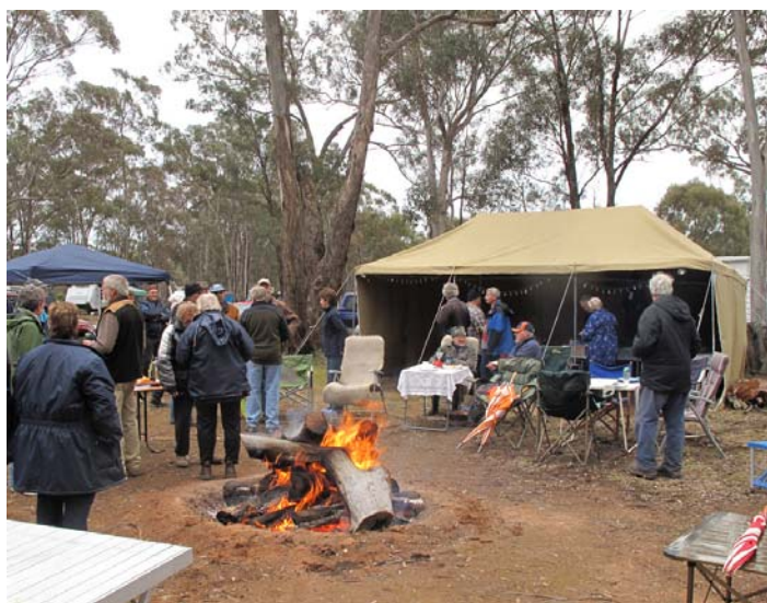
The main campfire early evening on Sunday