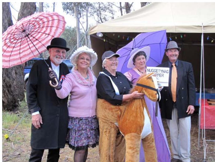
Fashions on the Field entrants