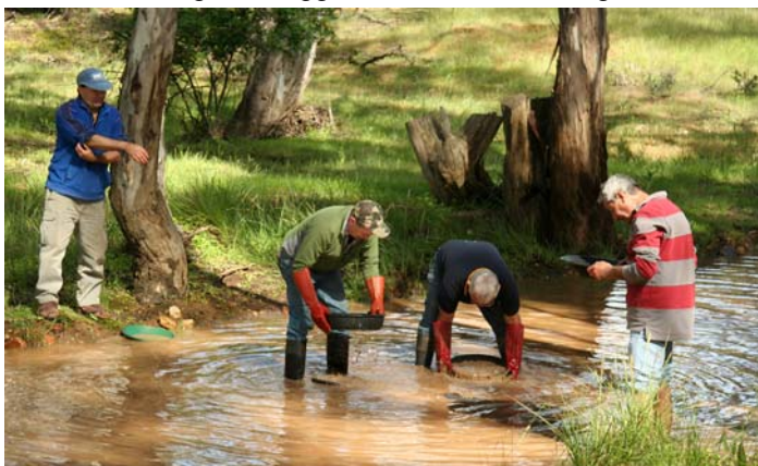
Panning in the track leading into the campsite from the main road after the huge rainstorm on Saturday night