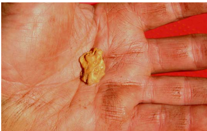
Marty's 13.8 gram nugget found near a puddler