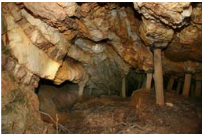
Worked out stope at Union Jack mine