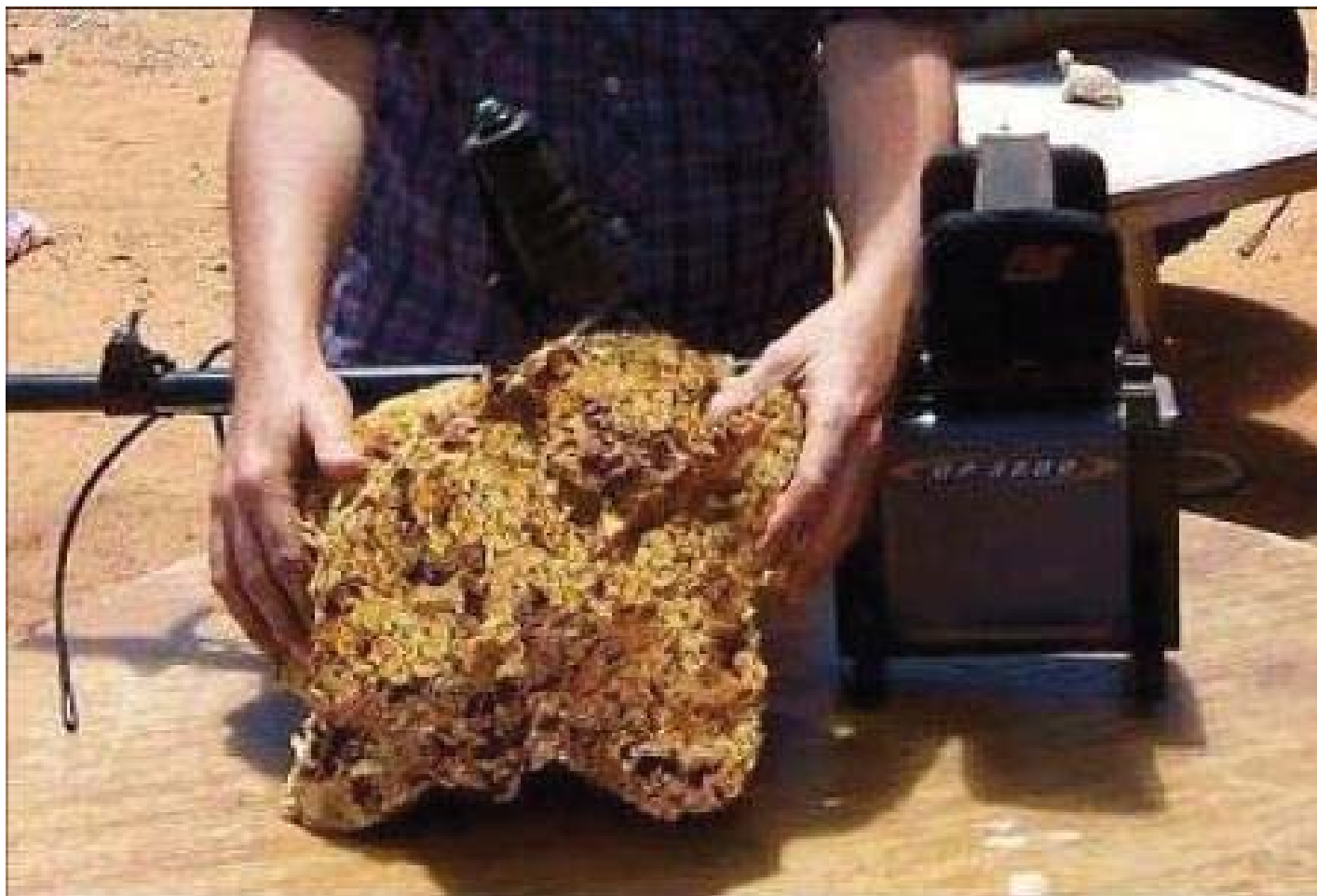
Another photo of the Big Ausrox Nugget Before the ironstone was removed.