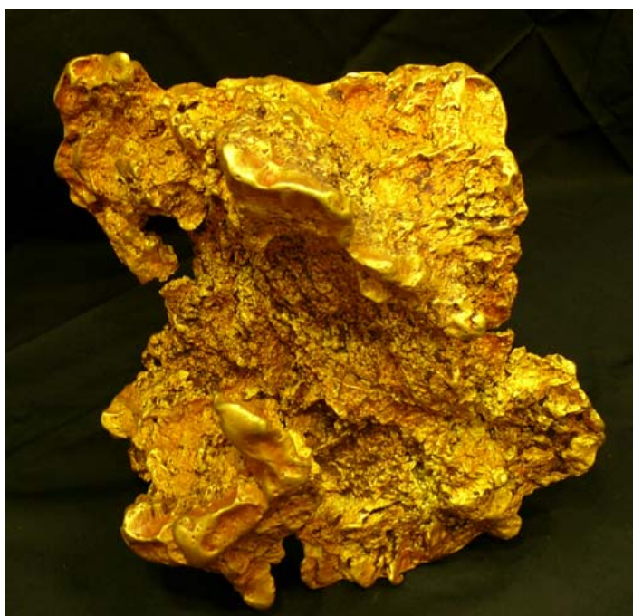
The Ausrox Nuggett

Editors Note: We have not yet had confirmation of this nugget's authenticity. However it would be very strange for a company like Ausrox to put their name to a nugget if it was not real.