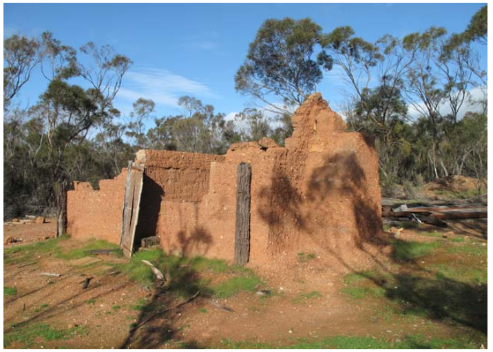
Ruined Mud Brick Hut near Scandinavian Lead