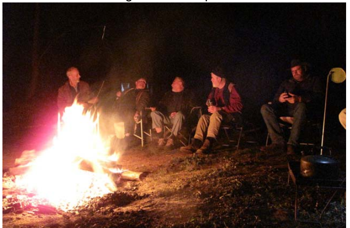
Around the campfire