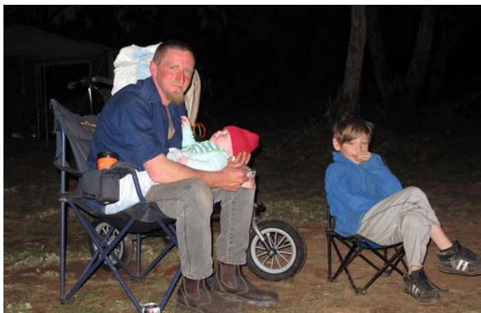
Following in Dad's footsteps?