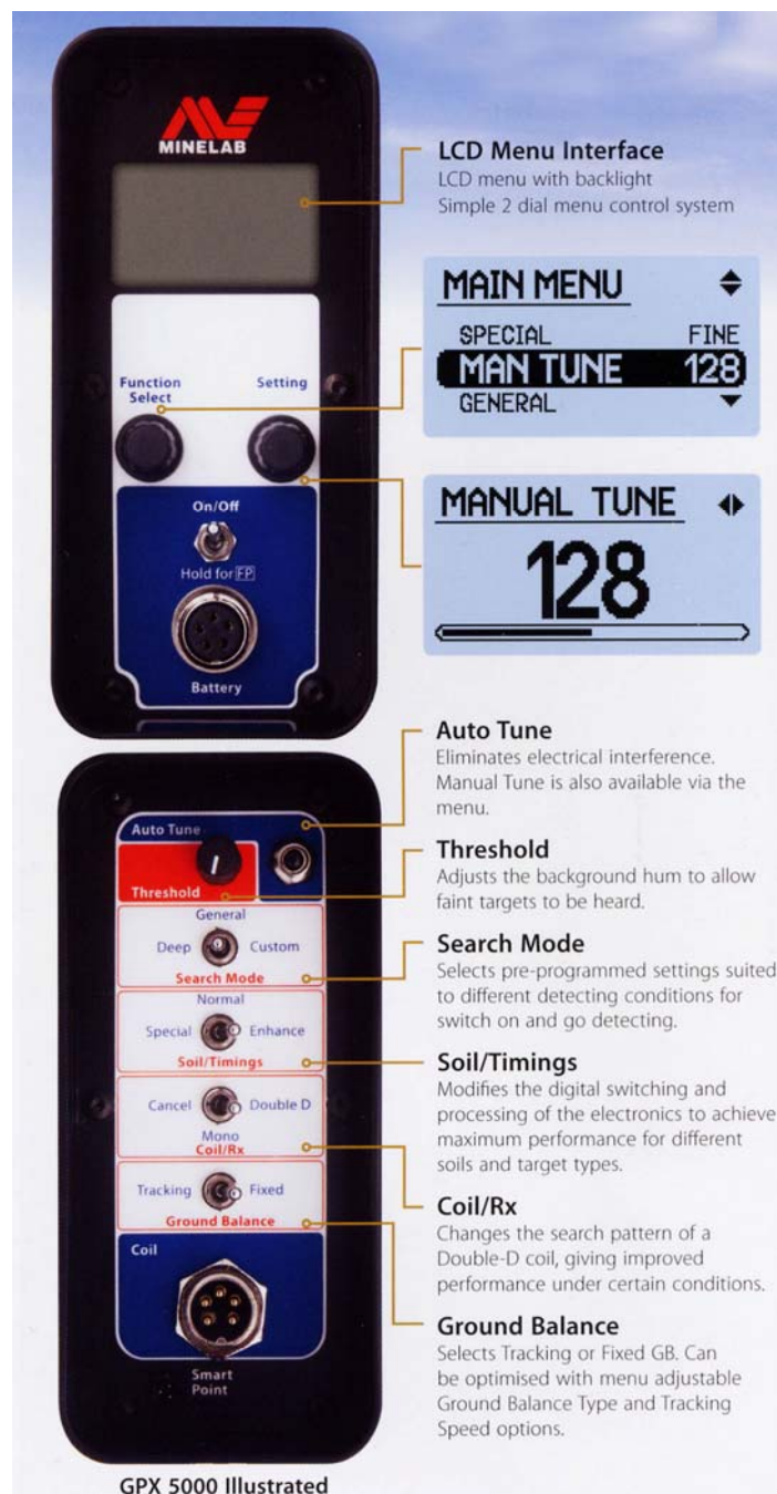
GPX 5000 Illustrated