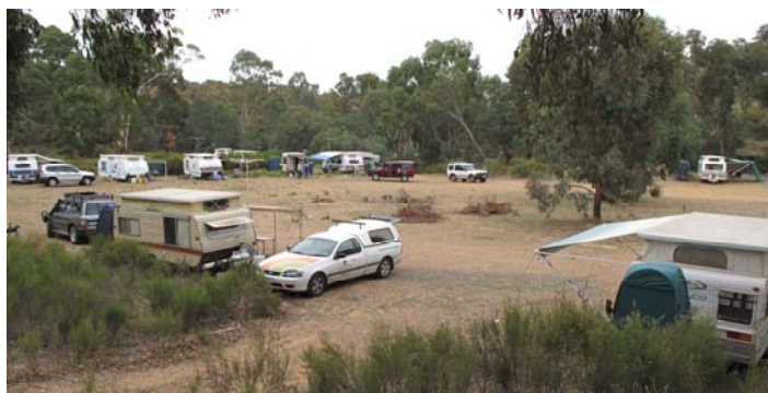
Chokem Flat Campsite