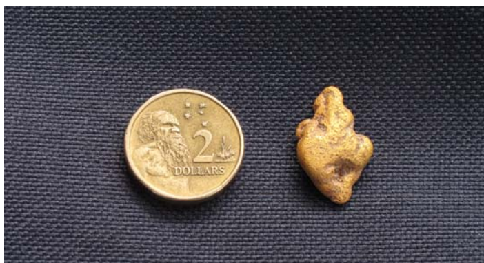
A nice 8 grammer