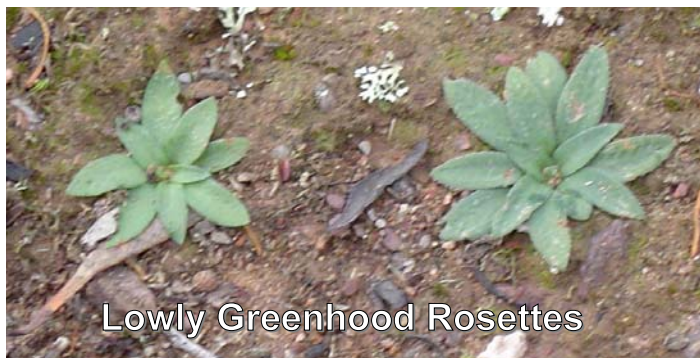
Lowly Greenhood Rosettes

The Lowly Greenhood orchid, although once common is now extremely rare to the point where there are only 6 known small occurrences in Victoria. These populations are mainly around Maryborough and Talbot. can be as many as 200 or as little as only 10 plants. This is a plant that for most of the year has a small circle of small leaves at ground level (called a rosette). It sends up a single short stem ( 2—8 cm) which may flower. During the two to three month flowering period (December to January), it produces up to six short, stout flowers which are translucent grey-green to brown, very similar to the colour of the leaf litter in which it grows. The rosette withers before flowering time.