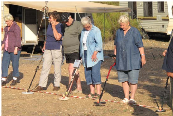
Ladies Egg Race