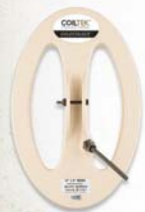
Goldstalker 14x9" BLITZ

You can rely and trust in their range of metal detector coils and accessories, knowing that you are Optimising Discovery when prospecting and metal detecting. Look for their fully Minelab approved X-TERRA coils.