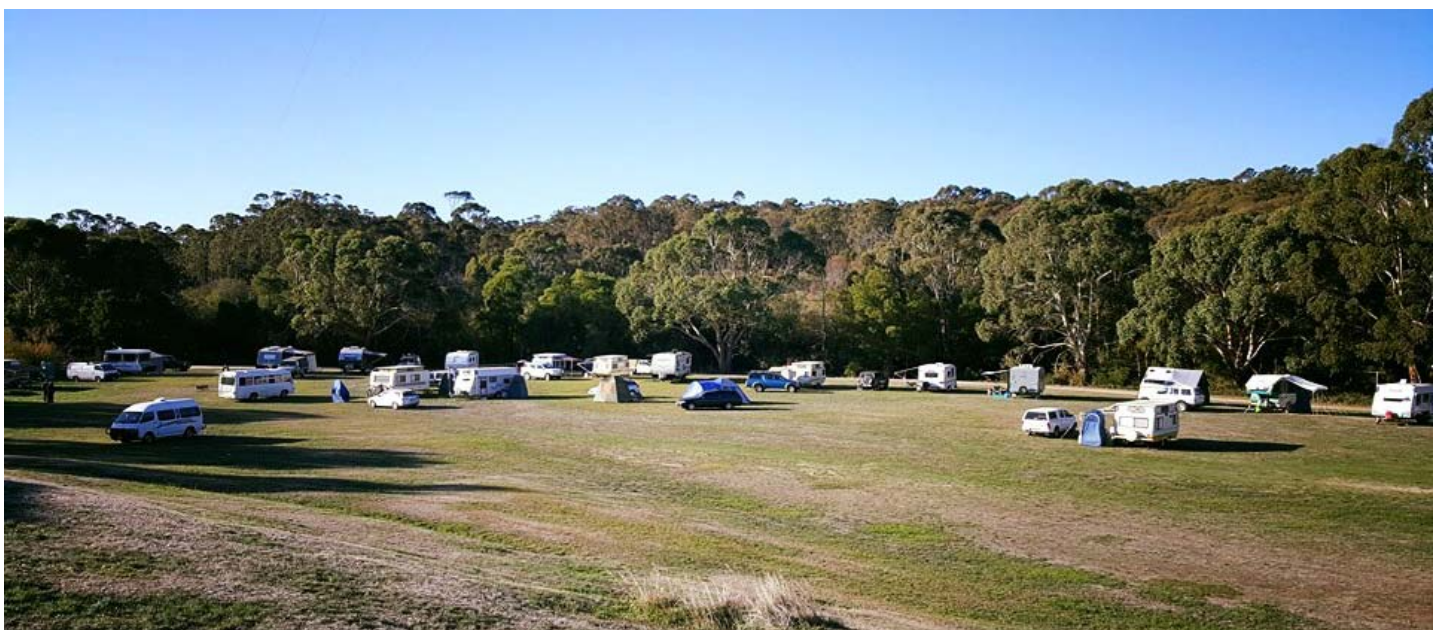
The old Creswick Soccer ground becomes a Seekers camp site