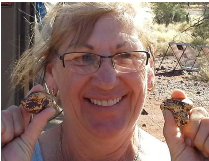
2.5 & 5 oz nuggets found in WA about a foot deep and with a Coiltek Anti-Interference coil with a Minelab GPX4000.