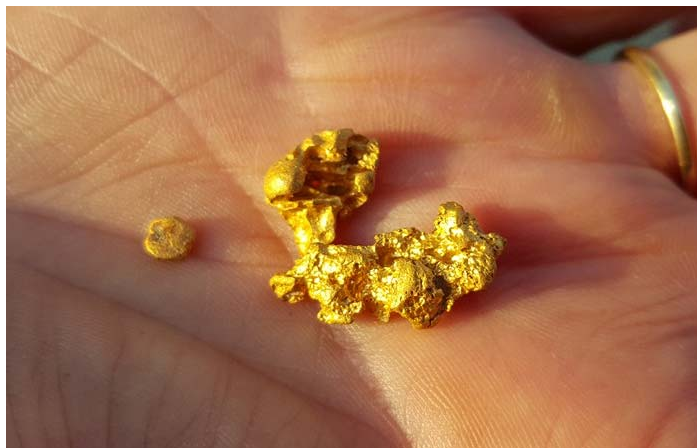
Anja's 4 grammer and some other smaller nuggets