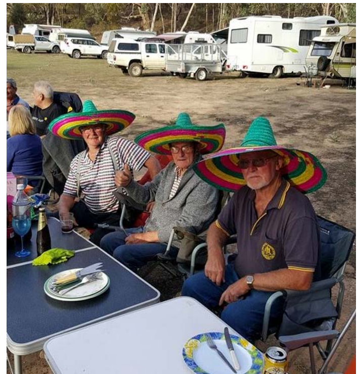
The Amigo Grummett Brothers