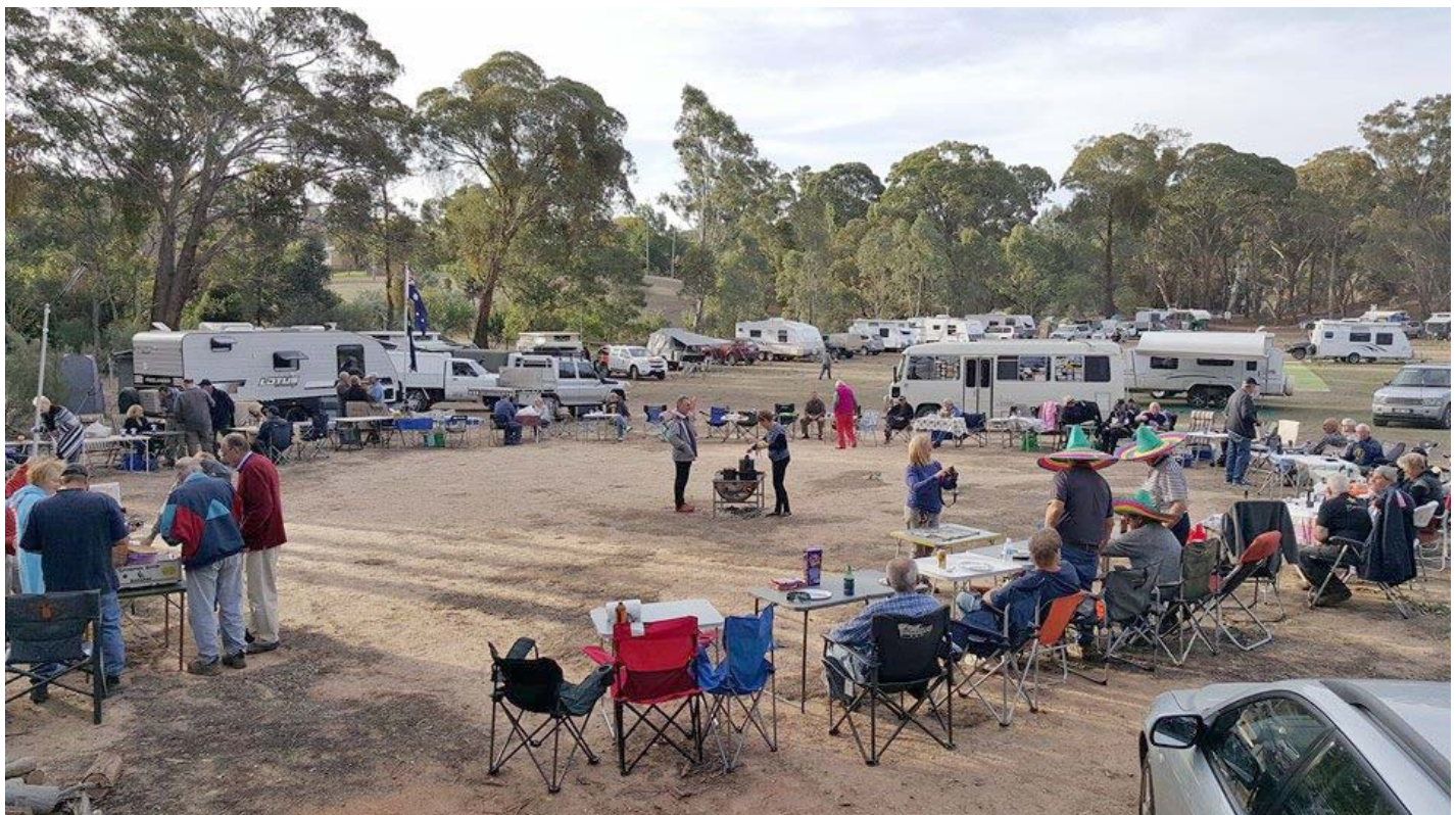
Round the campfire on Sunday Night getting ready for the Dinner.