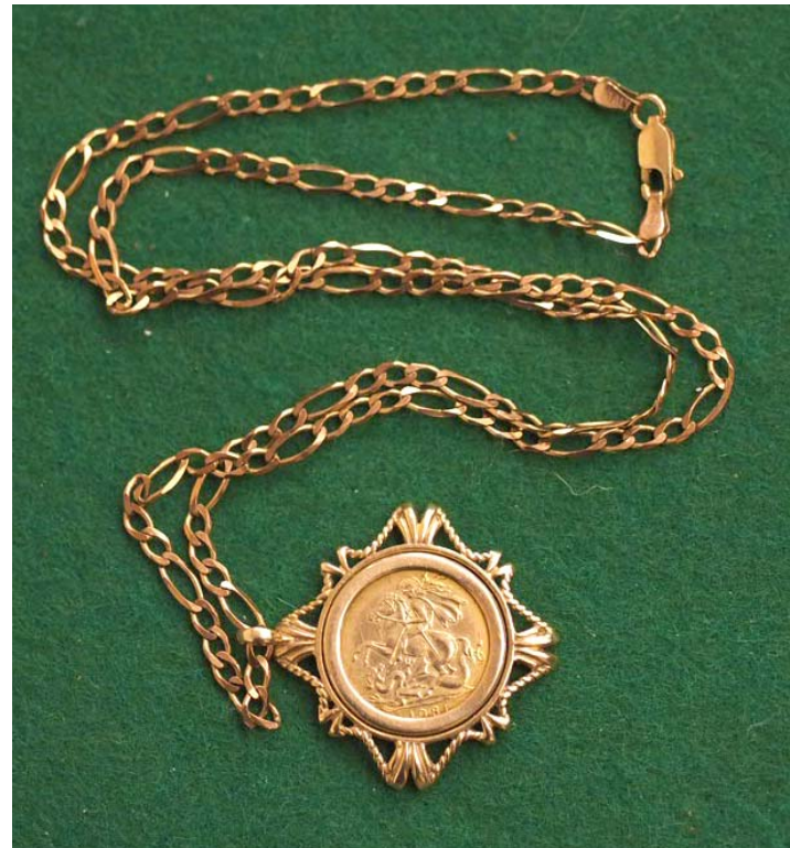
1981 Sovereign mounted on a chain.