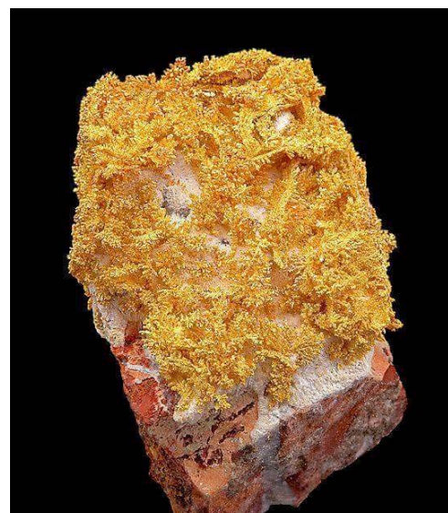
Fine dendritic crystallised native Gold on white quartz from the Excelsior Mountains, Nevada, USA.