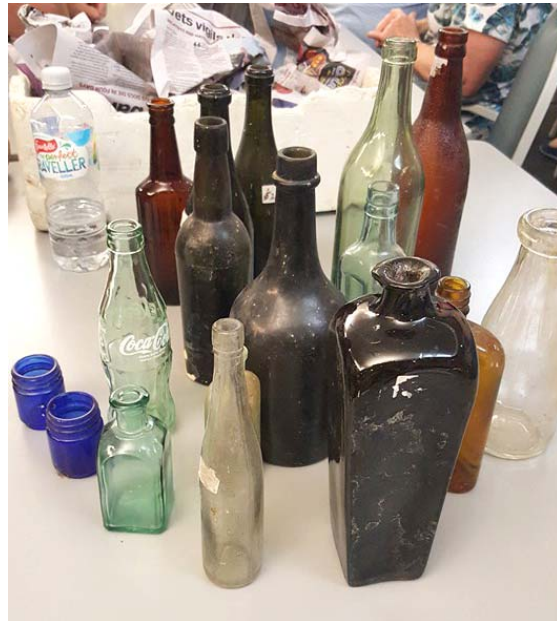
Members bottles on display..