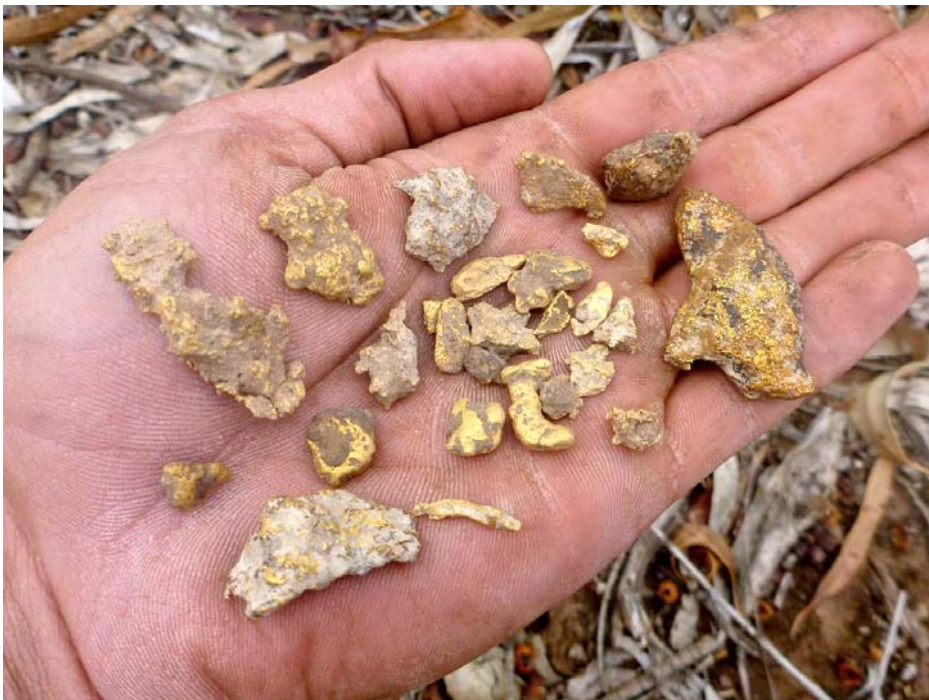
Members recent gold finds.