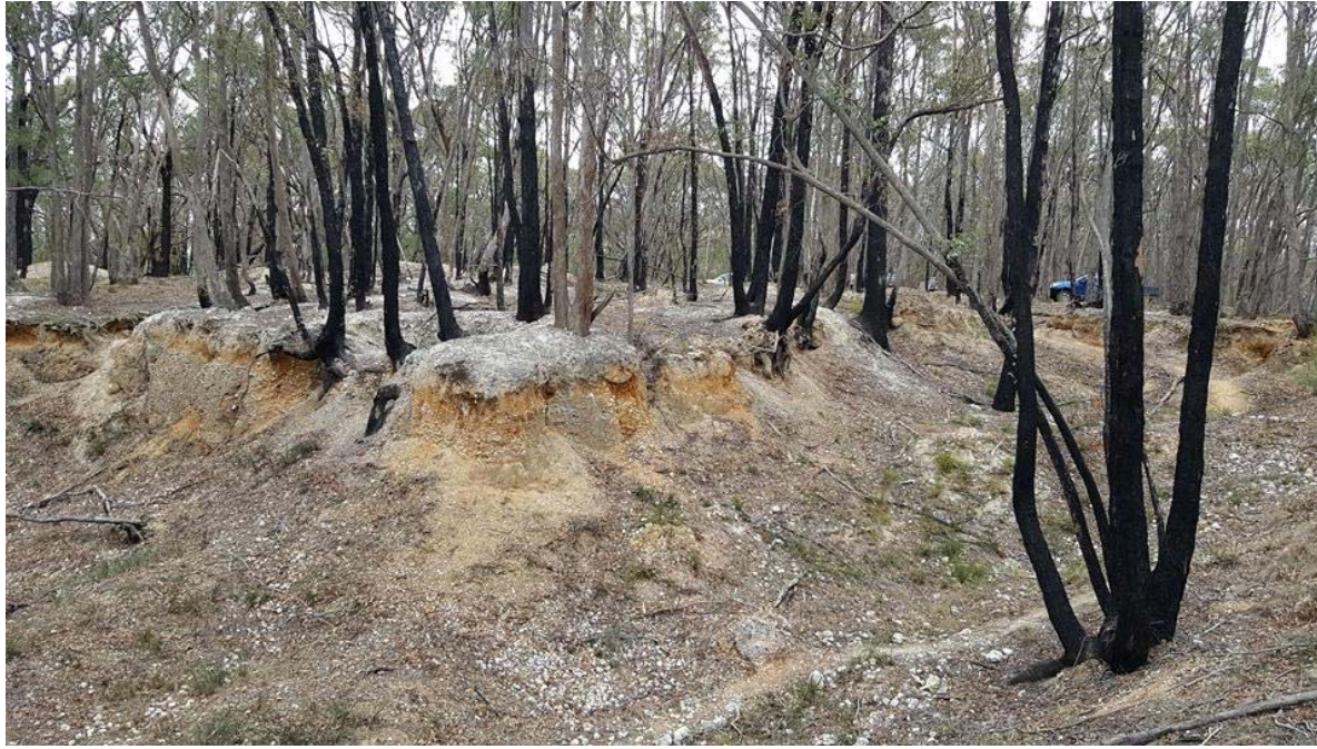
This is Tavistock Hill which was extensively sluiced.