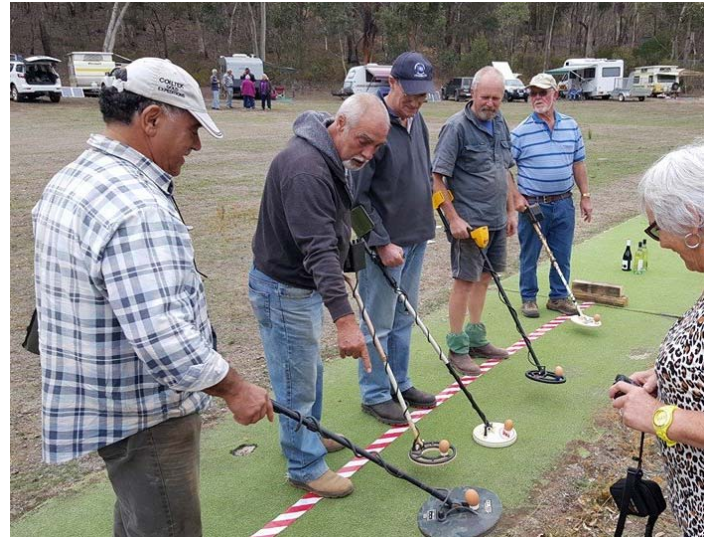
The men line up for the egg & detector race.