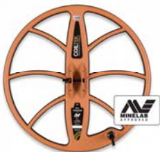
Coin & Relic 15" X-TERRA 18.75kHz © Fully submersible