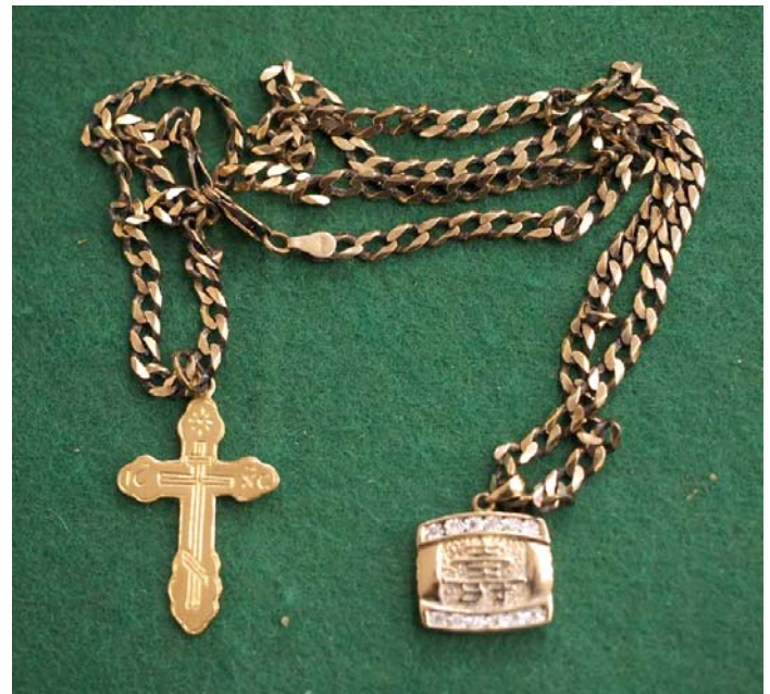
Gold Crucifix and medal on a gold chain.