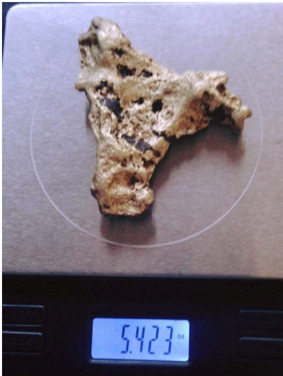
Nice 5oz nugget found in WA this week. (Not by a VSC member)