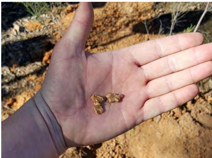
Rob's two nuggets totalling 9.8 grams.