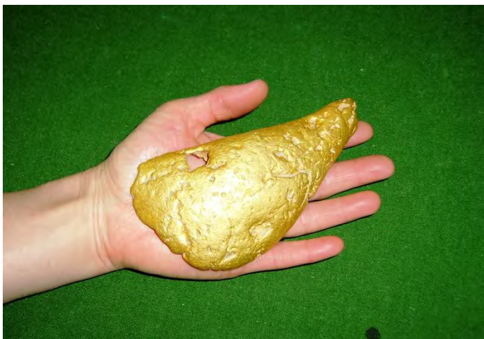
51oz at 910mm found with a GP3500 with a NF16 inch coil