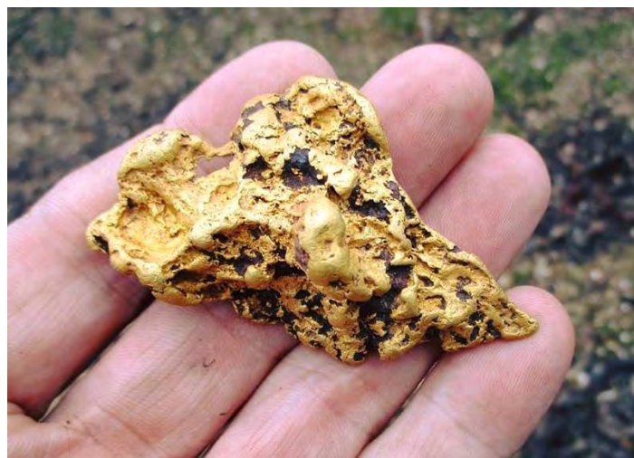
Found on 2016-06-17 in Victoria by a prospector on crown land with a GPX 5000. It was 8 inches deep and the signal reported to be very trashy, which is most likely the reason it was still there. It weighs 3.5 ounces.