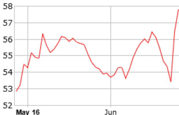
60 Day Gold Price in AUD/g

The Australian dollar gold price hit an all-time record of $1,826 an ounce on June 24 th after Britain elected to leave the European Union, with shares in local gold mining rallying strongly even though the broader stock market tumbled more than 3 per cent. The last time gold was near this price was in mid 2011 when gold reached a peak of AU$1806.50 per ounce. As the US dollar price of gold rises and the Australian dollar falls this causes a multiplying effect on the Aussie gold price. Prospectors who wish to sell their gold now would benefit from this high price.