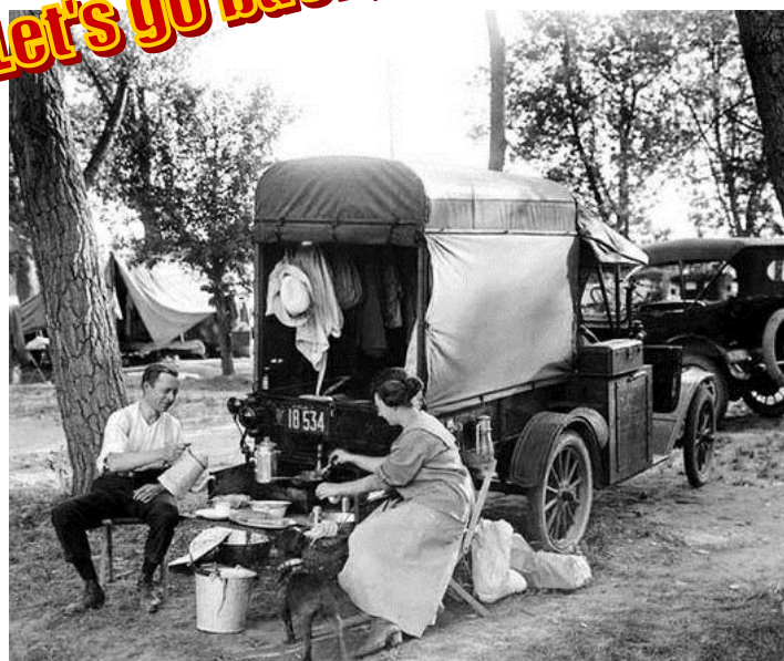
Car based camping in 1918.