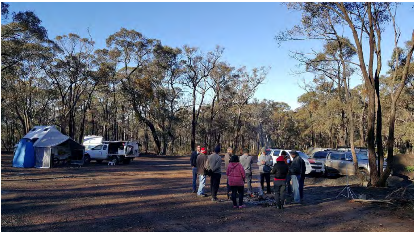
Round the campfire getting warmed up by the fire.