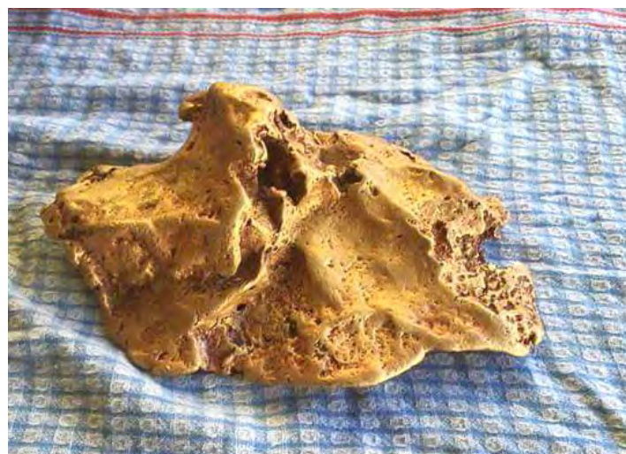
132oz nugget found near Sandstone in June, 2016.