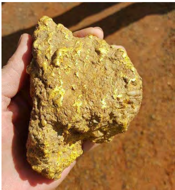
A great find of a nugget weighing 1.1kg (35.4oz) Found near Coolgardie, WA.