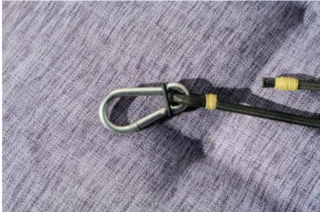
Close up showing the 'whipped' ends of the Bungee cord, and detailing the black rubber "O" ring which holds the cord in place on the clip.

The other end of the Bungee cord is passed through the shank of the Clip, which is to carry the weight of the detector. It is tied in place with a whipping of heavy white linen thread, which is also covered in super glue to create a hard-bonded end which is unlikely to come undone even under great load.