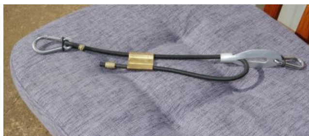
The complete Bungee cord arrangement. Note the black rubber "O" rings on the end clips which hold the Bungee cord in place.

Below is a small photo of the entire Bungee cord arrangement. The brass fitting in the middle of the cord is a retainer that has two circular holes or shafts running through its length. The hole through which the Bungee cord runs has a larger diameter than the cord itself, allowing it to flex, to move, without any friction on it. The second shaft hole has a diameter similar in size to the diameter of the Bungee Cord.