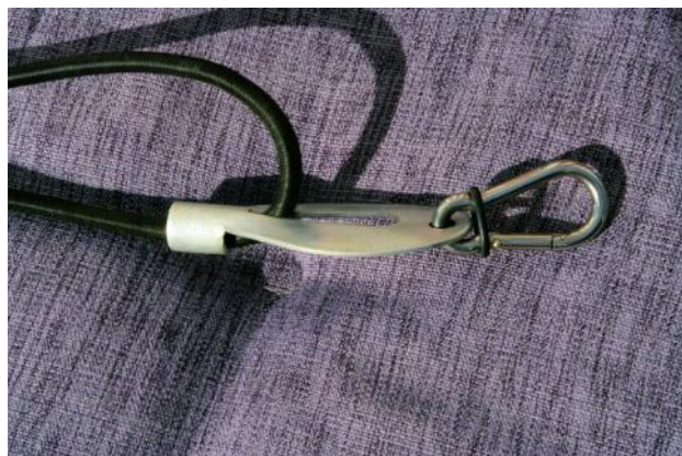
A close up of the Aluminium Bungee cord fitting. The Bungee cord passes through a circular hole at the bottom of it, the cord in turn passes through the variable width vee slot where it is locked in place by the weight of the detector.

I communicated these ideas and frustrations to my brother, Lindsay through numerous telephone conversations. Over a period of time, he came up with a suitable answer. An Aluminium fitting, which could be top mounted to the Pro-Swing harness and had a variable width 'vee' slot in it, to enable bungee cords of various diameters, to be shortened or lengthened.