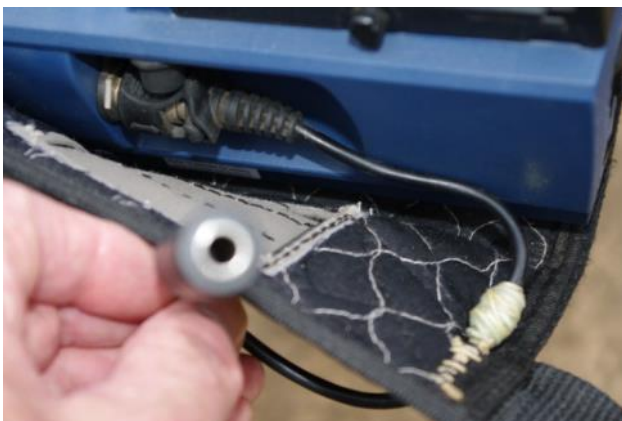
The above photo shows the 'SDC plug to normal ¼ inch plug' adaptor lead as it is permanently fitted to my SDC 2300.

One of the first things I did when I purchased my SDC, was to include the "short SDC plug to ¼ inch normal plug" adaptor lead; the SDC 2300 Headphone Adaptor lead, in the original purchase package. My head phones, a pair of Koss UR-30s, use the 'normal' ¼ inch, (6.35mm) stereo plugs and leads.