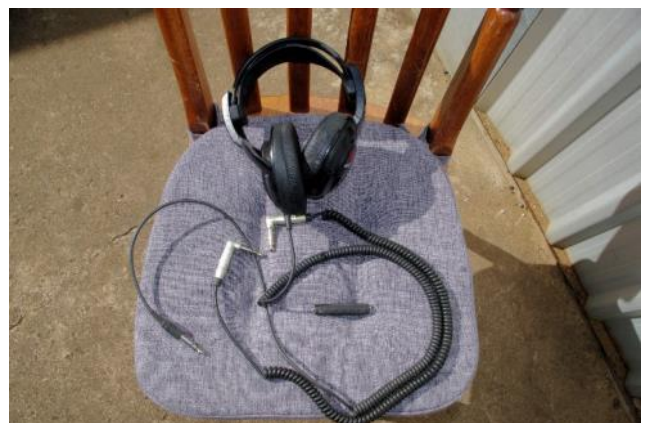
Set of Minelab Koss UR-30 headphones with lead, compared to the 'made-up' coiled extension lead complete with its two Amphenol right angled metal male plugs.

Equipped with the broken headphone cords, I returned to my local electrical shops where I purchased Amphenol brand right angled ¼ inch (6.36mm) male plugs, and cheaper "no-name" plastic right angled plugs and a "no-name" plastic double ended ¼ inch (6.35mm) female connector plug.