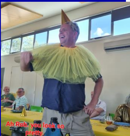
Moonambel New years Eve

The Victorian Seekers Club bi-monthly newsletter