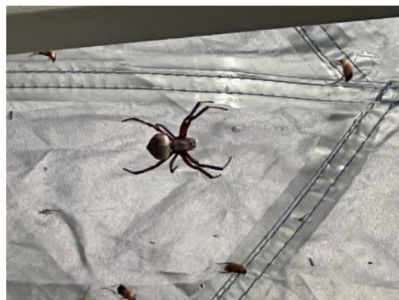
Spiders made there home in club marquee