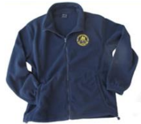
Fleecy Jackets $40.00 each