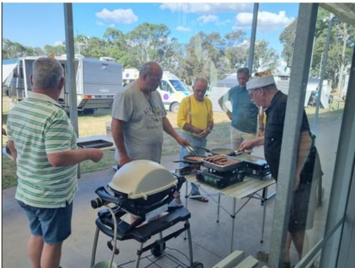
The big cook up