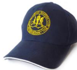
Caps $18 each

Samples available to try on at General meetings.