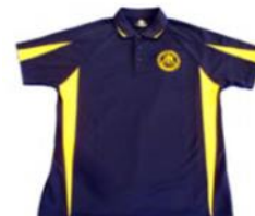
Lightweight Polo Shirts $35 each