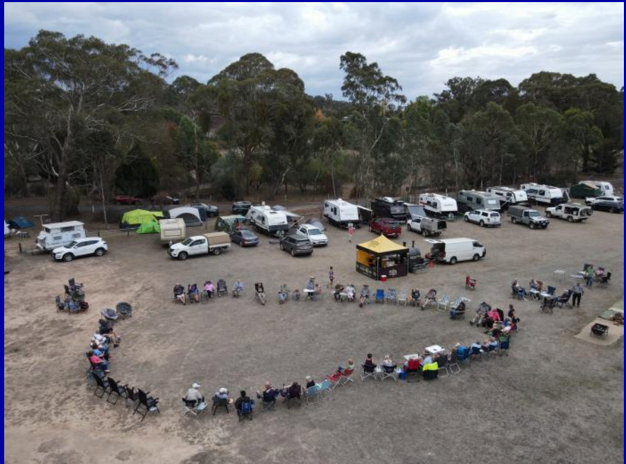
Aerial photo of Pizza night

Special guest Jimmy Cole and Marianne at Sunday night Five Flags Hotel dinner