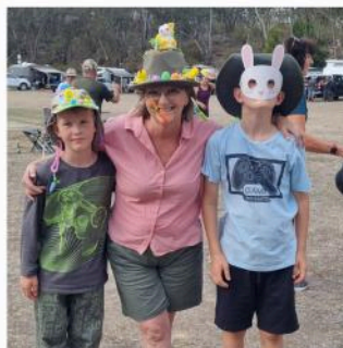
Easter Bonnet Parade