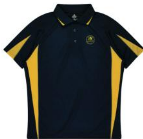
EUREKA MENS POLOS - 1304