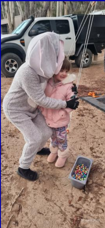
Easter Bunny Sunday morning

The Victorian Seekers Club bi-monthly newsletter