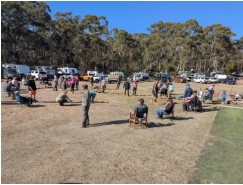
Stake your claim