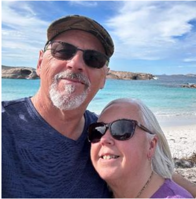
(The President and his wonderful "First lady")