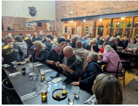
Five Flags Dinner